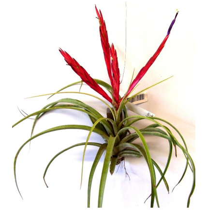
Tillandsia flabellata shown by Dave Boudier