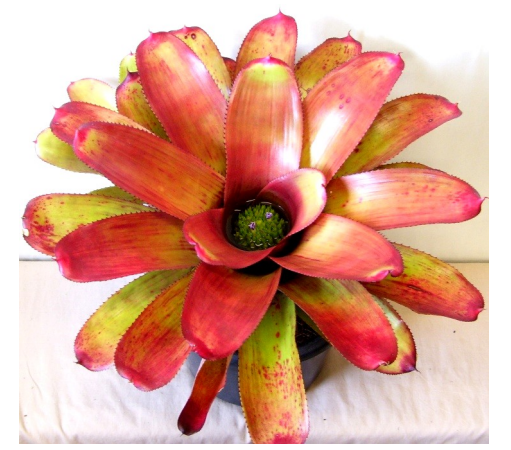
Neoregelia unknown ?? grown by Drew Maywald

• Check for quilling, these plants may require additional care to correct the problem. A little detergent in luke warm water poured into the vase of the plant, allow it to soak for a few minutes then gently tease the leaves apart, then flush it with fresh clean water. Repeat if necessary.